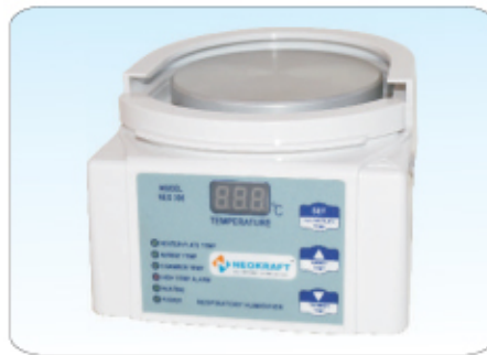
Non-Servo Humidifier with Display